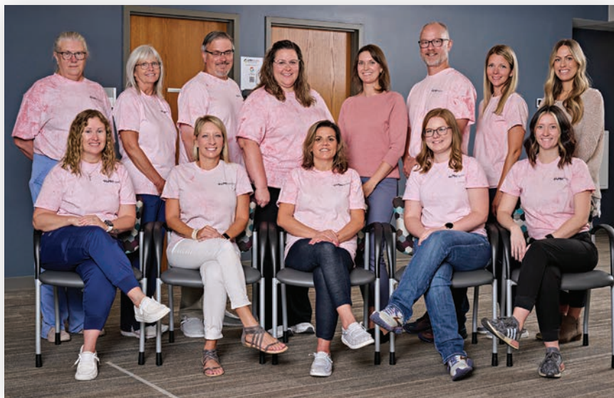
Photos, from top: LMH Health Primary Care-Eudora LMH Health Primary Care-Baldwin City LMH Health Primary Care-Tonganoxie

Improving access to primary care is an important first step to improving community health and overcoming health disparities. Discover how LMH Health is working to move the needle.